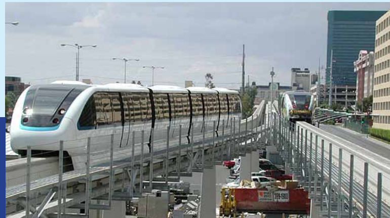
Monorail de São Paulo - Section 1 - Line 15, Bombardier Brazil

For more details go to website: www.nedland.nl/monorail