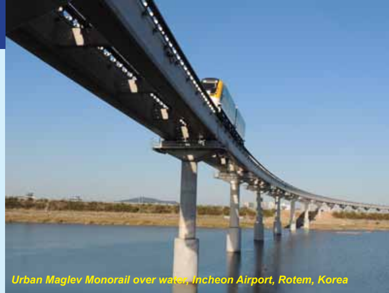
Urban Maglev Monorail over water, Incheon Airport, Rotem, Korea

SEMINAR ORGANIZERS This seminar is organized in close cooperation with Executive Council members of the International Monorail Association ( www.monorailex.com ) Las Vegas, USA. Seminar organizer: Nedland BV, Leusden, NL. E: info@nedland.nl Media Partners: Verkeer in Beeld, Acquire Publishing, Zwolle, NL Seminar Sponsors: The Monorail Society, Freemont, CA, USA Movares Nederland BV, Adviseurs & Ingenieurs, Utrecht, NL