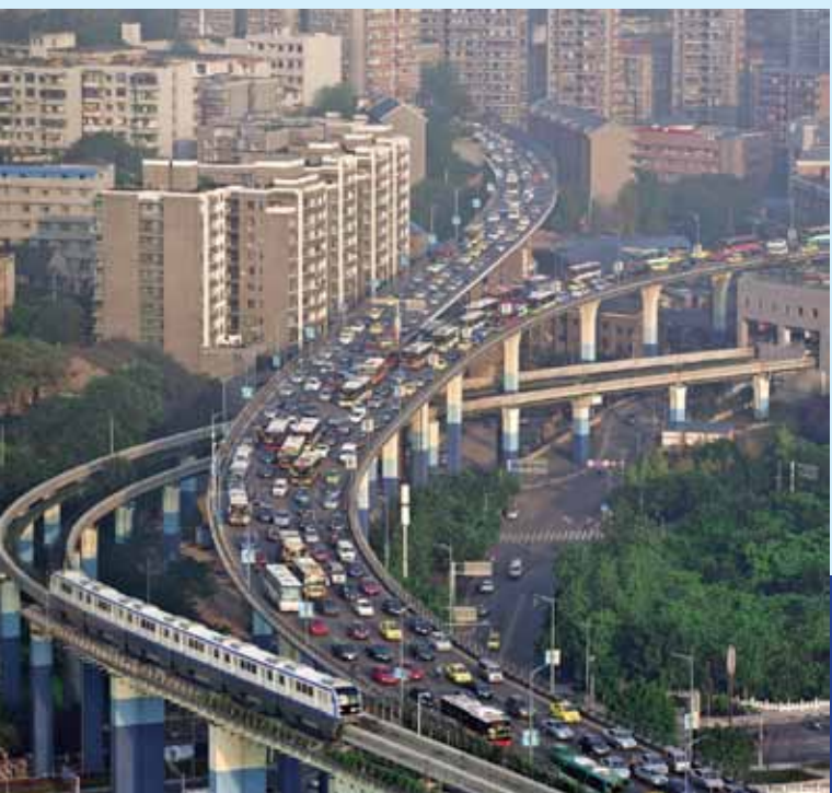
Chongqing Monorail, China length + 100 km, 38.000 passengers p.h.p.d.

Programma information The program provides an overview of the monorail systems that are in use around the world, information about the technical aspects, the cost ratio with respect to tram and metro, the high road safety and the possibilities that monorail can offer for the Netherlands in urban areas where space is scarce.