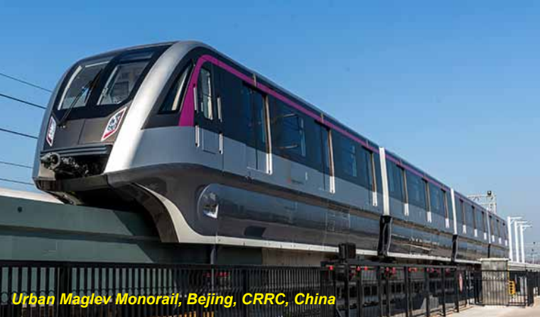
Urban Maglev Monorail, Beijing, CRRC, China